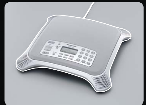
KX-NT700 IP Conference System

NCP500X and NCP500V both come with wall mount brackets as standard.