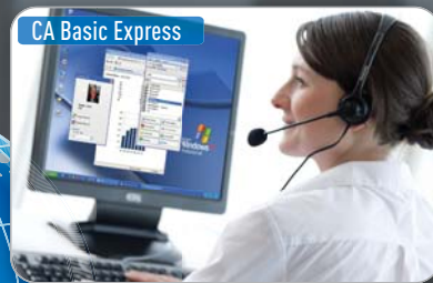
CA Basic Express