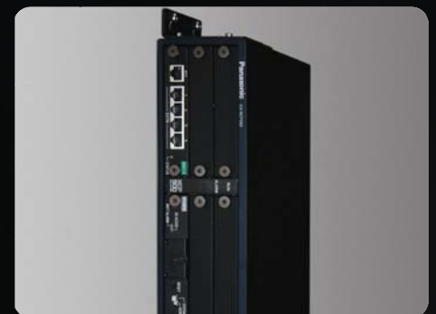
KX-NCP500X/V Wall Mount Bracket