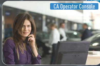
CA Operator Console